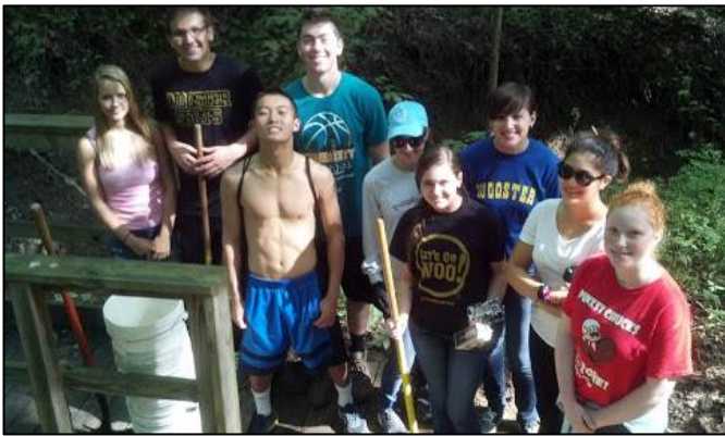
Enthusiastic group of College of Wooster 1 st -year students during their WMP in-service on 8/23/14.

As the summer weather fades, fall brings another great season to visit Wooster Memorial Park (WMP). The Friends of Wooster Memorial Park (FWMP), in cooperation with volunteers and the City, had very productive summer – an intense May workday to repair signposts, a big College of Wooster community service project, trail running events and a kids running camp, improvements to FWMP’s new Kenwood Parcel, and more.