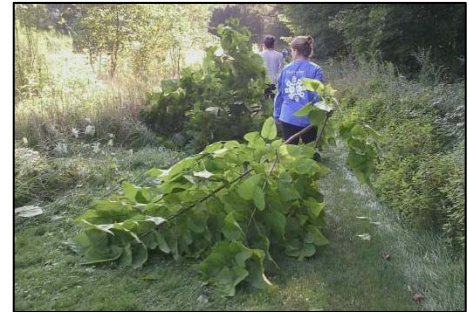
COW students drag cut catalpa trees during the August 23 work day (E. Swank)..

During the COW work day on August 23, FWMP and student crews cleared numerous fast-growing Northern catalpa saplings out of the old farm field. Catalpa is a large tree, with heart-shaped leaves, native to the southeastern U.S. It has become naturalized in many urban and rural locations in Ohio, including WMP.