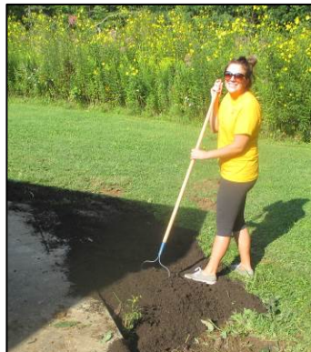
Above & right: COW students in the Education Area.