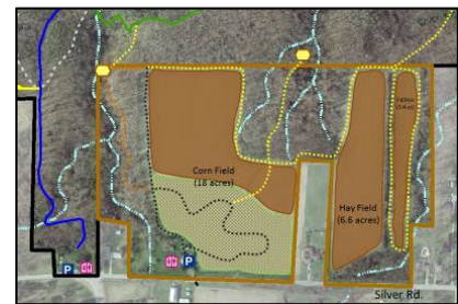
Proposed Kenwood Parcel trails.