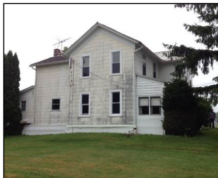
Left to right: Kenwood Parcel’s old farm house before, during and after removal.

The FWMP Board will continue their grant-seeking efforts. Two proposals were submitted in September 2014 for funds to install an informational kiosk and small gravel parking area at the future alternate park entrance. And the Board plans to submit a grant to the Clean Ohio Recreational Trail Fund in February 2015 to help fund the development of ADA-accessible trails, parking lot and possibly other facilities.