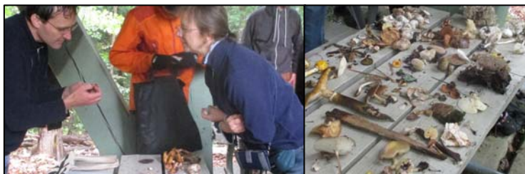
Fungal Foray participants (left) identify the many species of mushrooms (right) that were found.

On a rainy Saturday morning in early October, 40 fungi aficionados from the Ohio Mushroom Society and the OSU Columbus campus headed out onto the trails of WMP in search of mushrooms for their Fall Foray. Over 40 species of fungi were identified from the morning's hunt.