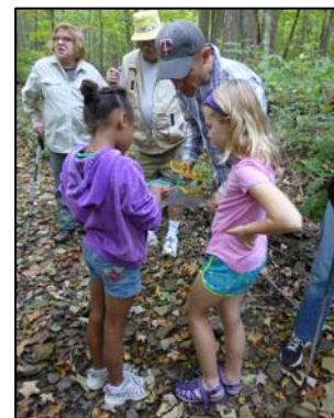
Kids look at spotted salamanders.