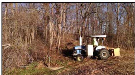
Dan Yarnell mows invasive shrubs. J. Abt.

yam, two new invasives, were spotted on Kenwood Acres and swiftly controlled, thanks to FWMP volunteers. In November, Dan Yarnell with the City spent several hours mowing the invasive shrubs growing around the edge of the Education Area and Kenwood Acres, with guidance from John Abt. All these collective efforts protect the natural integrity of the park.