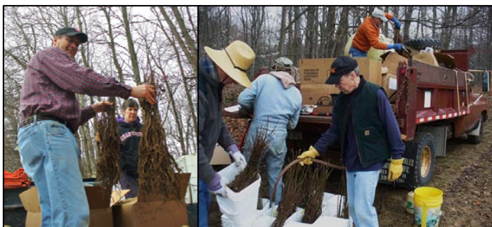
Volunteers unpack and prepare trees for planting.