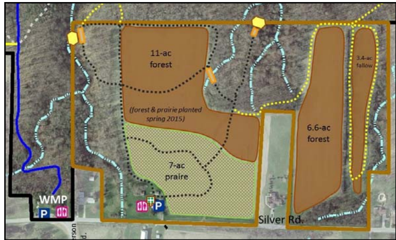
Proposed ADA trail (black dotted) & parking area on Kenwood Acres.

The Friends of Wooster Memorial Park (FWMP) Board is excited to announce the funding of FWMP's Recreational Trails Program (RTP) grant for Kenwood Acres! The project will create an Americans with Disabilities Act (ADA)-compliant park entrance and a 1.1-mile ADA interpretive nature trail on Kenwood Acres in the southeast corner of Wooster Memorial Park (WMP). The project also involves the development of a professional master site plan for Kenwood Acres. The new ADA entrance will be located on Silver Road a short distance east of WMP's main entrance, and serve as an alternate parking area and trailhead for WMP. The ADA trail will loop through Kenwood Acres' newly planted forest and prairie, and afford dramatic views of two wooded ravines.