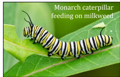
Monarch caterpillar feeding on milkweed