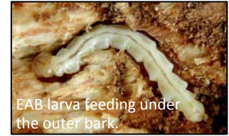
EAB larva feeding under the outer bark.

The ash trees in WMP are now showing obvious signs of infestation by the exotic emerald ash borer (EAB). This wood-boring beetle, originally from Asia, has been working its way across the Eastern U.S., killing millions of ash trees as it goes. Unfortunately, with no easy control methods for EAB, we expect the practical extinction of ash in WMP.