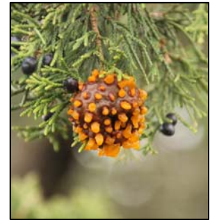
Cedar apple rust fungus on juniper (J. Chatfield).

Directions: The Freedlander Park Chalet is located at 400 Hillside Drive in Wooster. If heading north on Burbank Road, you'll cross Oldman Road, then turn right onto Buena Vista or Hillside Drive; both lead into the Chalet parking lot. RSVP's are not required.