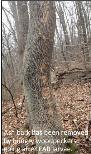
Ash bark has been removed by hungry woodpeckers going after EAB larvae.

The ash trees in WMP are now showing obvious signs of infestation by the exotic emerald ash borer (EAB). This wood-boring beetle, originally from Asia, has been working its way across the Eastern U.S., killing millions of ash trees as it goes. Unfortunately, with no easy control methods for EAB, we expect the practical extinction of ash in WMP.