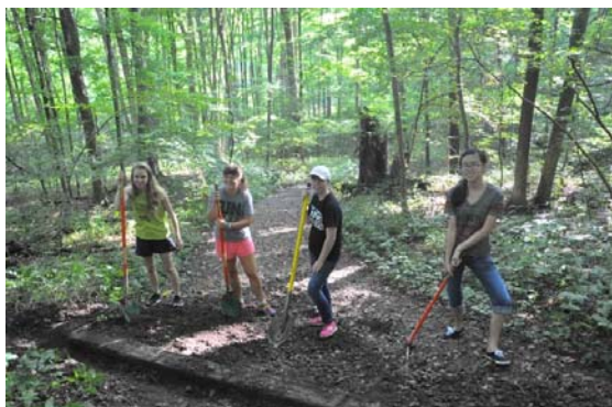
Enthusiastic first-year College of Wooster students clear water bars on the Spangler Trail hill during the COW Community Service Day.

[Oops! We got a bit behind with the fall newsletter, so here's a special year-in-review edition.]