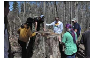
COW students learn about tree rings.