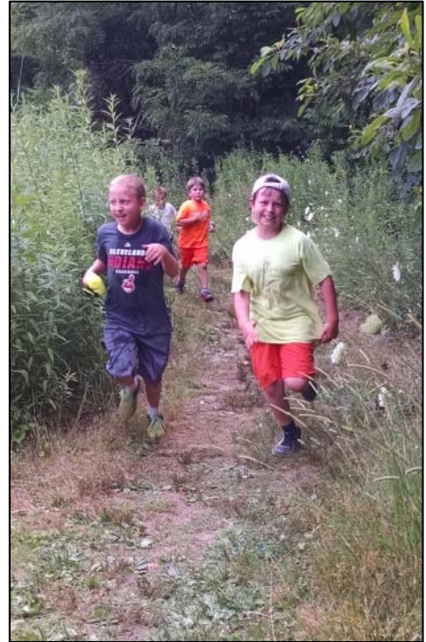
Kids show how fun running can be!