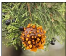
Cedar apple rust fungus on juniper (J. Chatfield).

campfire and S'mores. So we had a follow-up event on October 14 to have our campfire and eat up all the S'mores!