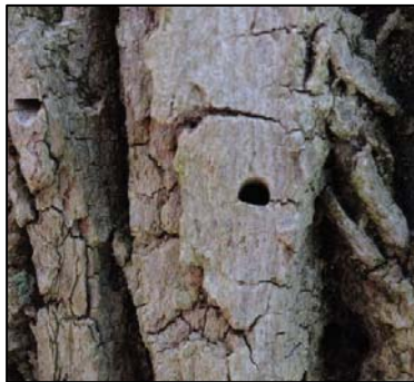
"D"-shaped exit holes made by EAB adults as they exit the ash tree.