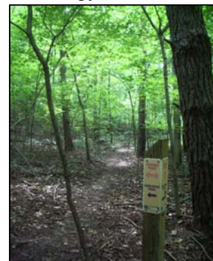
Leaf litter on trails helps reduce trail erosion.