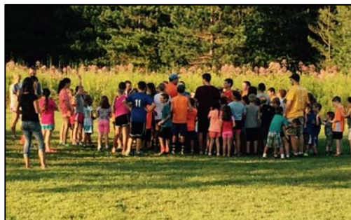
Kids are excited to run during the Kids Running Camp (Dan Buehler).