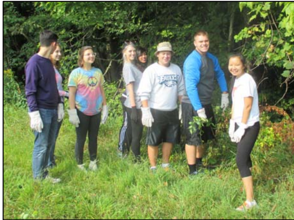
Enthusiastic group of College of Wooster 1 st -year students pull invasive plants on the Kenwood Acres during their in-service on 8/29/15.

Over 100 volunteers helped Friends of Wooster Memorial Park (FWMP) and the City complete dozens of projects at Wooster Memorial Park (WMP) since April's Annual Meeting. Projects ranged from planting native plants and removing invasive ones on Kenwood Acres, to re-installing sign posts, clearing tree falls on trails, rerouting trails, painting blazes on trees, and picking up glass. Volunteers have contributed more than 675 work hours to improve the park. We encourage you to read on for more details and thank you to all who support WMP.