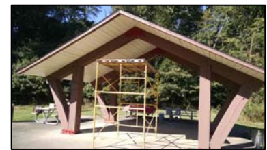
Freshly painted Education Area pavilion (John Abt).

Pavilion Gets a Fresh Coat – The Education Area pavilion got a fresh coat of paint this summer. COW students painted the lower portions of the pavilion during their August workday, and then FWMP volunteers borrowed scaffolding from the City and finished off the hard-to-reach areas over the last couple weeks. It looks great!