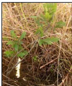
An oak seedling hidden in the grass.

A Forest Down Under – What happened to the 7,500 tree seedlings planted by FWMP volunteers and Twinsberry Tree Farm on the Kenwood this spring? They’re hiding down under... the weeds. The tall grasses actually provided an excellent summer shelter, and obscured the seedlings from nibbling animals. Some trees did not survive, but a large number did and have set good buds for next year. We will do a formal census in spring 2016 to determine the number and distribution of live trees.