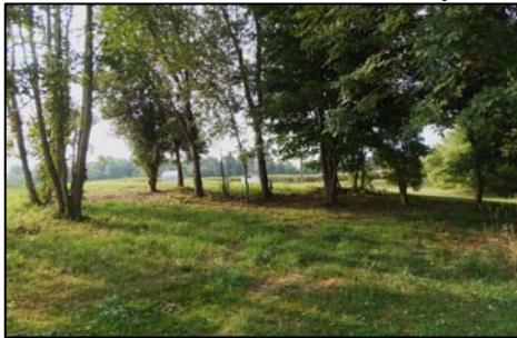
Now that it is cleaned up, this area would make a nice picnic spot (Shelley Schrier).

Clean-up of Future Silver Road Entrance – The old homestead site along Silver Road is another step closer to becoming an official alternate entrance for WMP. Over the summer, FWMP hired Nieman Excavating to dig out and haul away remnant concrete and debris from the farmhouse demolition. They also filled the old dug well. Then