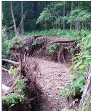
Outer Trail erosion along the Run (John Parker).

Power of Water & Trail Reroutes – Erosion continues to impact the trails in the park. FWMP had to re-route two different trail sections this summer, one along the upper Trillium Trail and one along the east Outer Trail. WMP is ever changing.